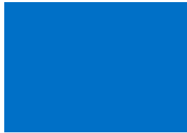
#21 Peacock Blue