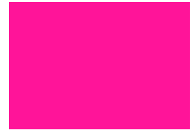
#90 Fluorescent Pink