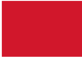
#19 Fire Red