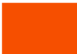
#20 Brilliant Orange