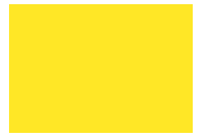
#94 Fluorescent Yellow